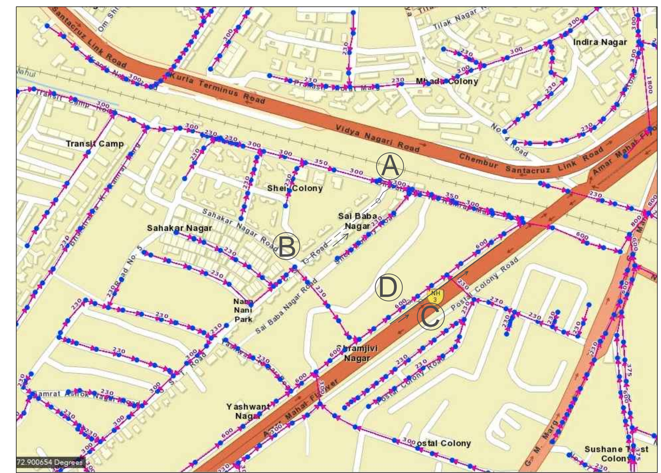
NORTH LOCATION PLAN SCALE - 1:4000